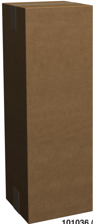
101036 (Box Only) (10"x 10"x 36"OD)

Total: 101036 (Box) = n/c or MX3014-HS = $180