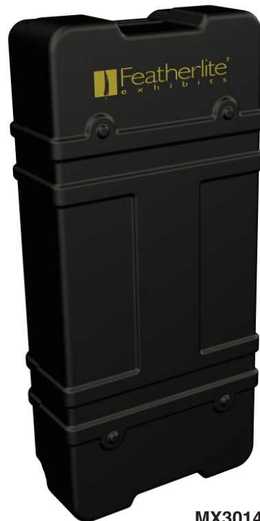
MX3014-HS (33"x 15"x 7"OD)

*Other larger cases also available upon request for multiple units